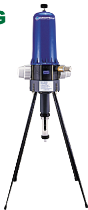
D20S 100GPM $1,842