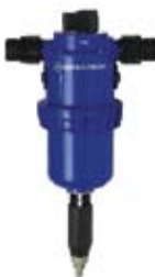
D45 20GPM $399