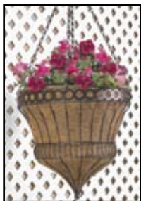
Queen Elizabeth Parasol

#14 Hanging Basket with Chain Hanger 79-3500 AG – Antique Green $13.42 each $80.52 case (6 per case)