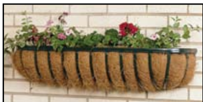
Flat Wire Horse Trough

#14 Hanging Basket with Wire Hanger 79-3525 BK – Black 79-3525 WH – White 79-3525 HG – Hunter Green $3.54 each $88.55 case (25 per case) #16 Hanging Basket with Wire Hanger 79-3530 BK – Black 79-3530 WH – White 79-3530 HG – Hunter Green $4.36 each $108.90 case (25 per case)