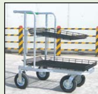
22" x 32"