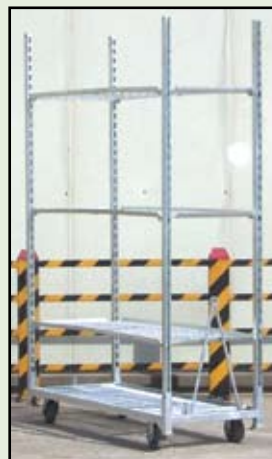
22" x 59" Transport Cart

#48-6500 $249.00 ea Transport Cart Shelf Only #48-6500A $32.00 ea